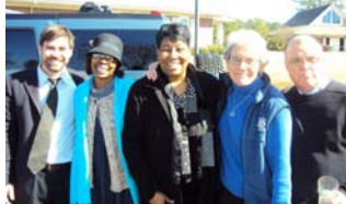
Together Baton Rouge members going to the Community Leadership training in Alexandria.