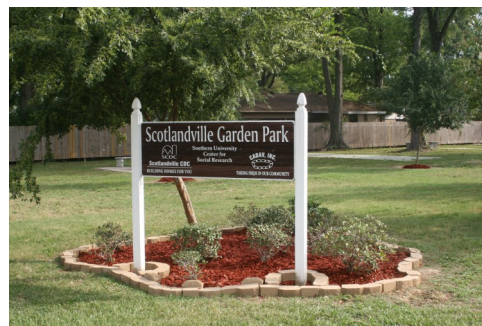
Picture showing the current state of the Scotlandville Garden Park.