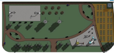
Revised Pocket Park Sketch Proposal

On Tuesday October 25, at the monthly CADAV meeting, at the Scotlandville Library, students from the U+R CDRC presented the revised sketch proposal for the pocket park design to be developed at the Scotlandville Garden Park, located on the corner of Goudchaux Street and Pembroke Street. This will be the first pocket park developed for the community under the Scotlandville Comprehensive Community Development Plan (SCCDP). On Tuesday September 27, the students presented the first sketch proposal idea to the community for feedback and input. This presentation was to give the community members an update on the progress of the park design. Additional feedback was given at the meeting that will be incorporated into the next phase, which will look at cost estimates and implementation procedures. If you would like to give your feedback or suggestions on the development of the Scotlandville Garden Park, email us at info@urcdrc.org or call us at 225.771.2001. On Tuesday November 22 at the next CADAV monthly meeting, U+R CDRC students will present the next phase of the pocket park development.