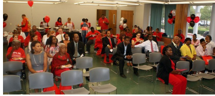
Top: Community members, businesses owners and Scotlandville friends signing in for the CADAV meeting; Bottom: Community members, businesses owners and Scotlandville friends listening to the presentations at the CADAV meeting on 7/26/11.

On Tuesday July 26, Community Against Drugs and Violence (CADAV) held its annual Membership Gala. Over fifty community members, business owners and Scotlandville friends and family attended the meeting and listened to the presentations made by several local organizations and politician's. The Scotlandville Comprehensive Community Development Plan (SCCDP) was discussed along with its implementation process.