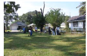
Top Left: Before image of one of the lots that was cleaned during the Scenic Sweep. Top Right: After image of the lot.